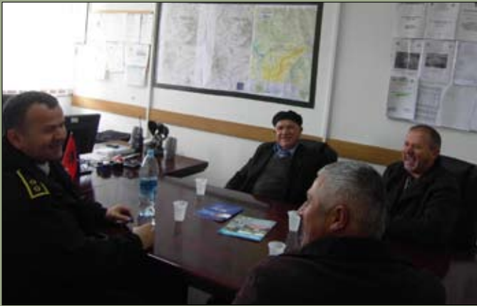
Community satisfaction with the work of the Border Police!