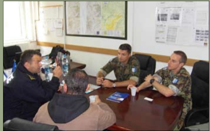
Cooperation with KFOR!

authority and functioning of the police, the police activity is manifold, as it acts in the prevention and detection of crime, providing the prosecutor and the court with sufficient material to initiate criminal proceedings and during this period provides also forensics assistance, support for the enforcement of judgments, provides data for evidences and legal requirements and under the supervision of the prosecutor conducts the investigation. Today, the police has more powers as it has built the specialized units for investigating crime, such as : the unit of serious crimes, anti-drugs unit, anti-terrorism unit etc. These are only some of the most important powers of the police under the KPPK. certainly in our other topics we will talk extensively about police powers and its rights during criminal proceedings.