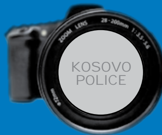
Images of the Police activities with the motto 'Say no to narcotics'