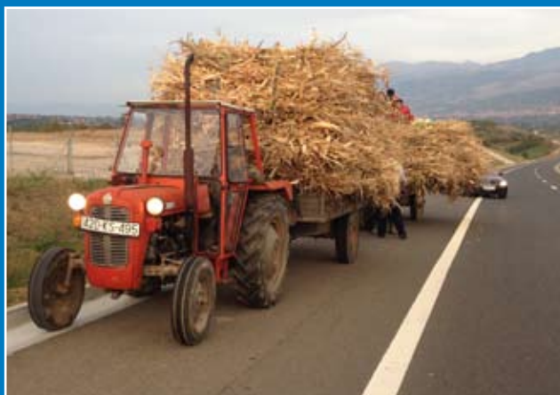
Unusual events in Kosovo highway

The highway is not for parties. The images from stopping of a wedding party in the emergency bar to rest, to gather and make party, using the highway for dancing and fun.