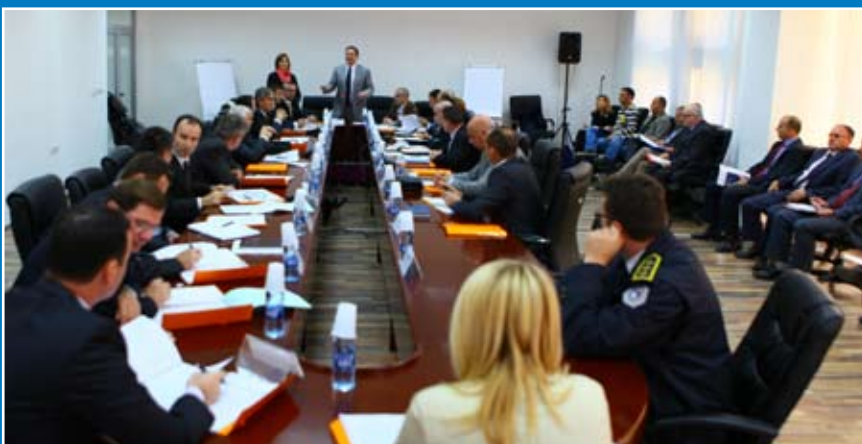
The workshop "Follow the money" brings together all the institutions of law enforcement