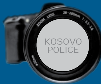
PHOTO NEWS ФОТО НЕМС