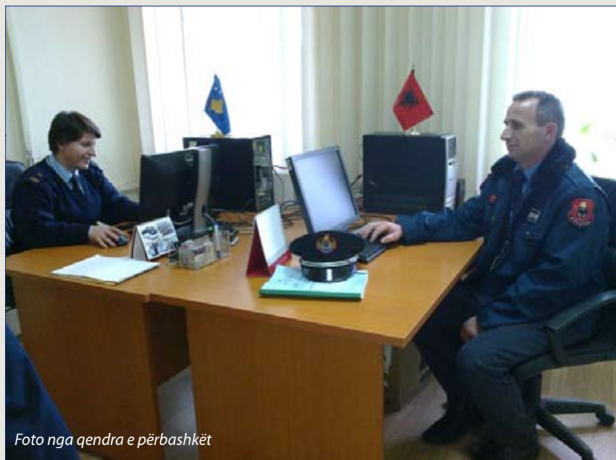
Foto nga qendra e përbashkët

Such practices were very successful especially with the Republic of Albania, where joint agreements have been signed in the area of policing especially