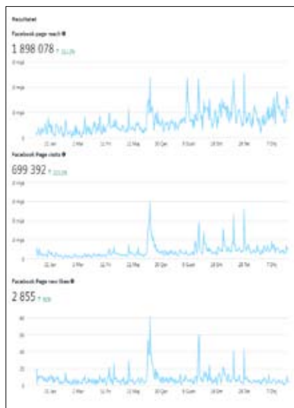
(The chart which continuously shows that the KP Facebook page is growing)

Clarification: Thanks to the work, commitment and publications during 24 hours, 7 days a week coming from the media office, the KP website is the first in the country as the most visited and most liked by citizens/followers. It should be known that there has never been any sponsorship or boost to increase such likes.