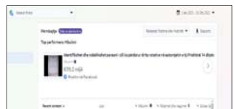
(The chart that shows the most viewed and commented article for 2021 on the Facebook social network)